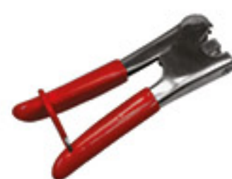
Sealing grips PLASTOSEAL™ REF 35588