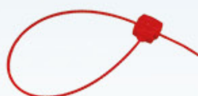
PLASTOSEAL™ (Box of 300 parts) REF 35417