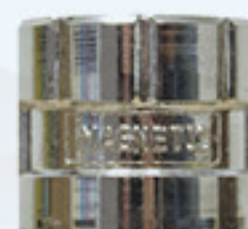
RAPIDCAP™ REF 35591