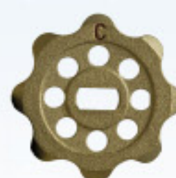
WHEELKEY™ REF 35592