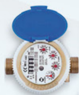
Velocity meter MID 160 REF 43978 (110) REF 43979 (170)